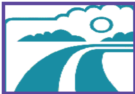
Pathways to Employment

Vocational Services offered by Onondaga Case Management Services (OCMS) are in keeping with the overall mission of the agency; OCMS programs are designed to help individuals and families, who have encountered certain obstacles, develop the resources and supports to live a satisfying, naturally interdependent life. Our team concept stresses the important role vocational services can play in recovery. Evidence based, best practice vocational models, are proven contributors to recovery.